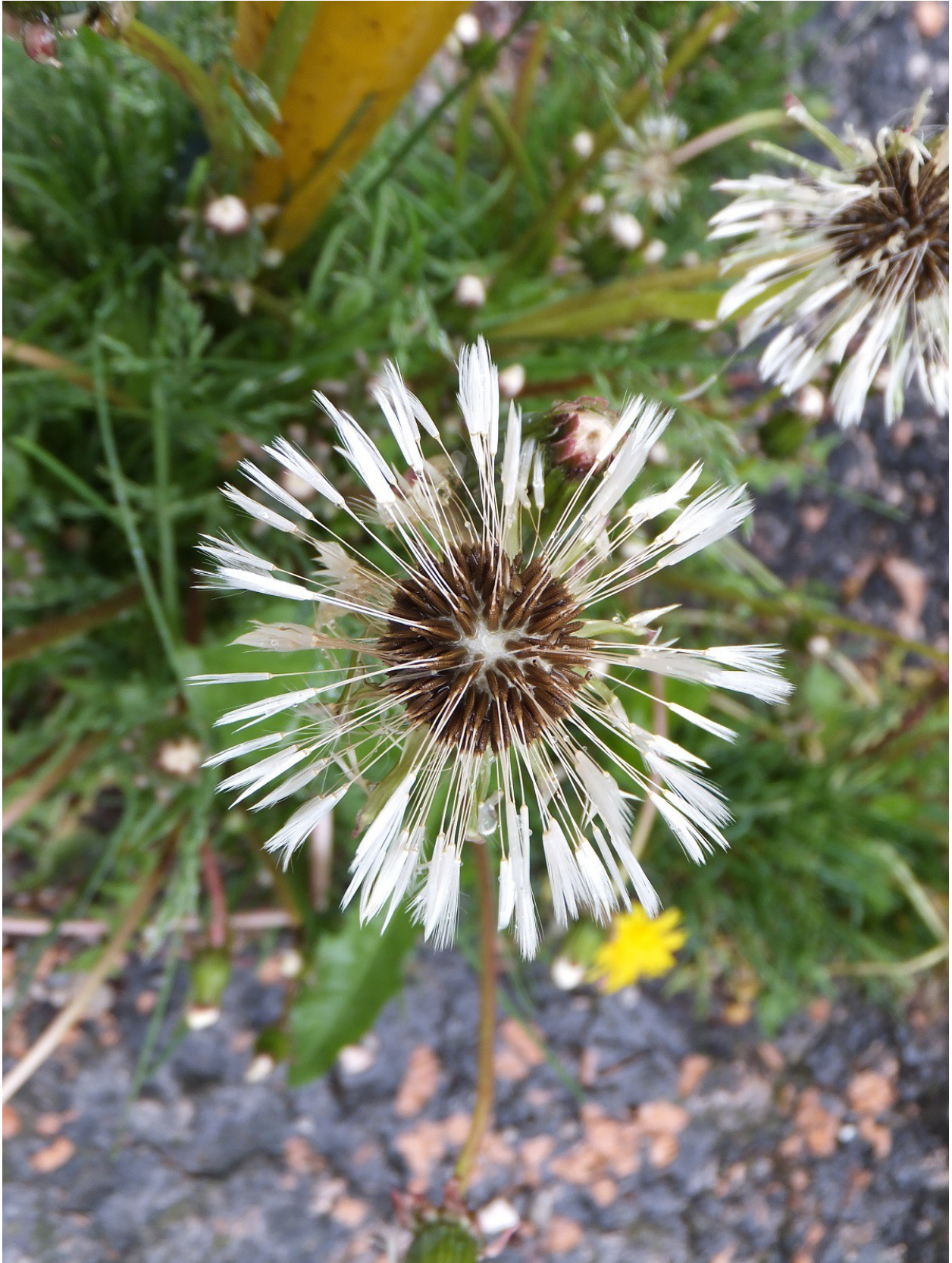
Dandelion head after rain.