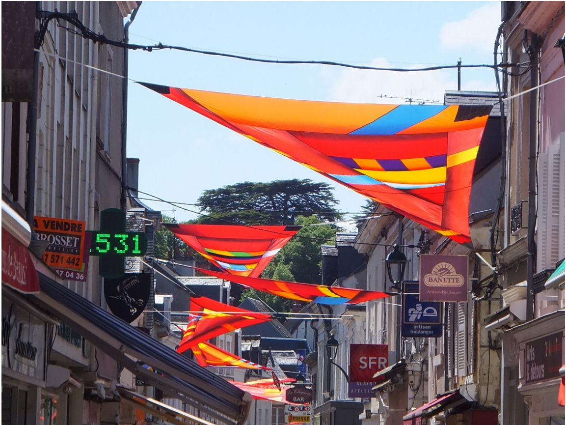
Flags in the main street of Amboise.