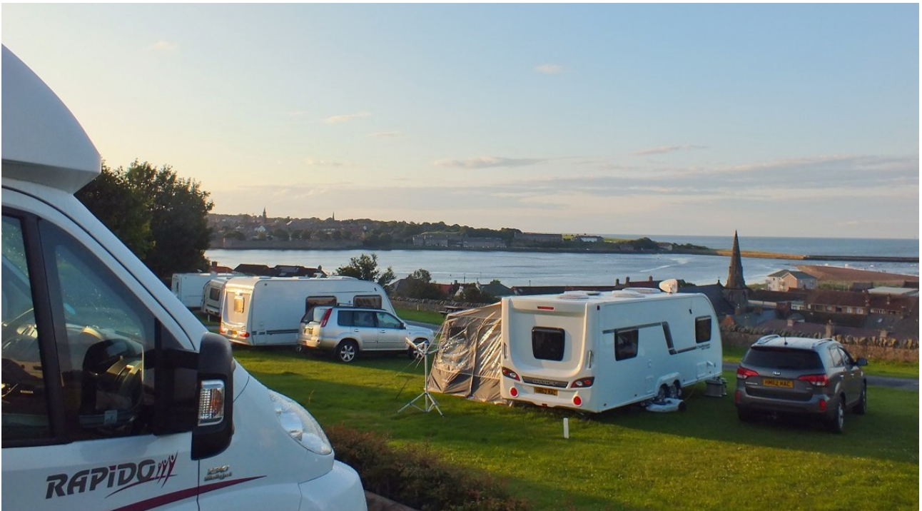
The site has a great view of the harbour and the walled town.