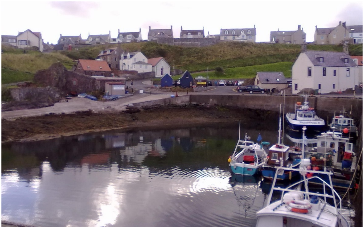
We also visited St Abbs on the scooter